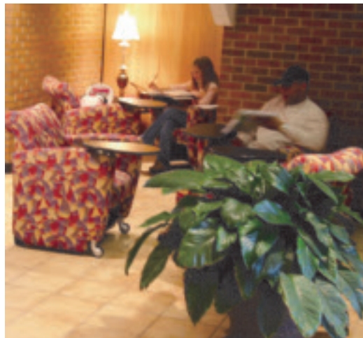
The Internet Café's comfortable chairs make studying hours on end a little less "painful."

The Internet Café area features a self-serve coffee bar and a browsing area of new best-selling fiction and nonfiction books to which new titles are added monthly. More computers with internet access also were added. Frank Williams in University Relations framed pictures featuring scenes of campus life and various AUM buildings which line the lobby